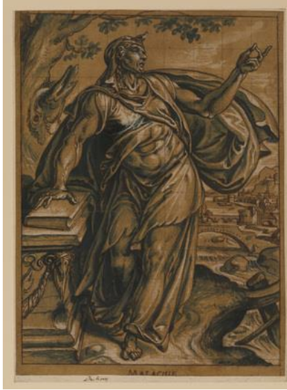
The Prophet Malachi. Hoey, Nicolas d' 16th century & 17th century