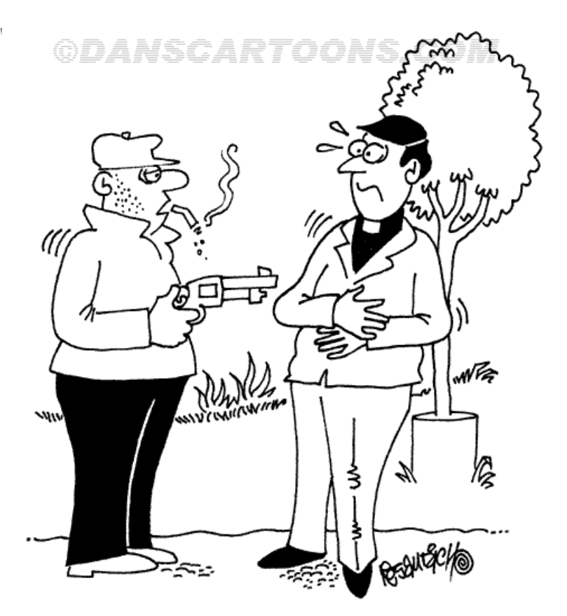
"Where can I reach you if I want to repent, reverend?"

Scripture readings from the New Revised Standard Version Bible copyright 1989 by the Division of Christian Education of the National Council of Churches of Christ in the United States. Psalm from The Psalter copyright 1994, Liturgical Training Publications. Variable worship texts from Sundays and Seasons 2021 copyright 2020 Augsburg Fortress.