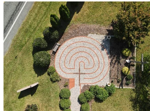
Aerial view of the prayer labyrinth at The Lutheran Church of Our Savior, Rehoboth Beach, Delaware.