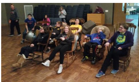
The youth of Willowbrook Christian Church and First Presbyterian Church of Victor held the first FPOC Rock A Thon, raising more than $1,500!