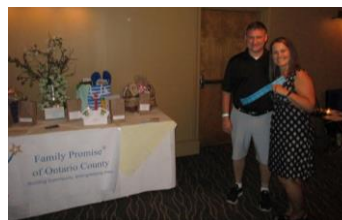
The Echomen chose FPOC as beneficiary of this year’s reunion concert and raised more than $1,300! Thank you to all who donated baskets!