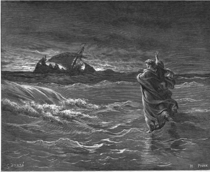
JESUS WALKING ON THE SEA He saith unto them, It is I; be not afraid.... (John 6: 20)