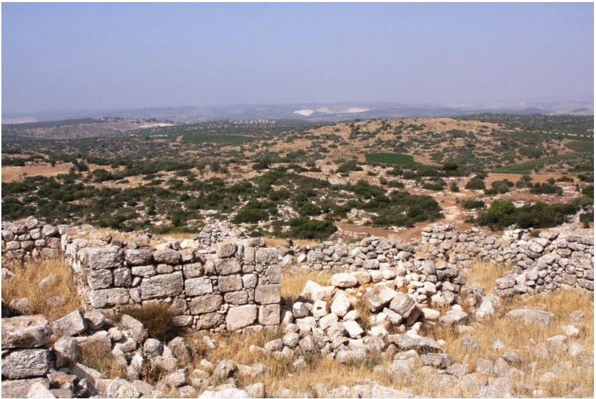
Excavation at Burgin, a settlement after the return from the Babylonian Exile